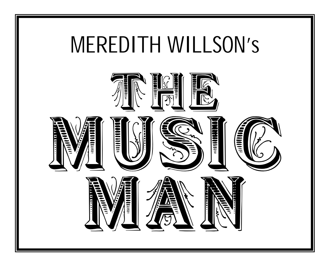
July 17, 18, 19 and 24, 25, 26, 2009